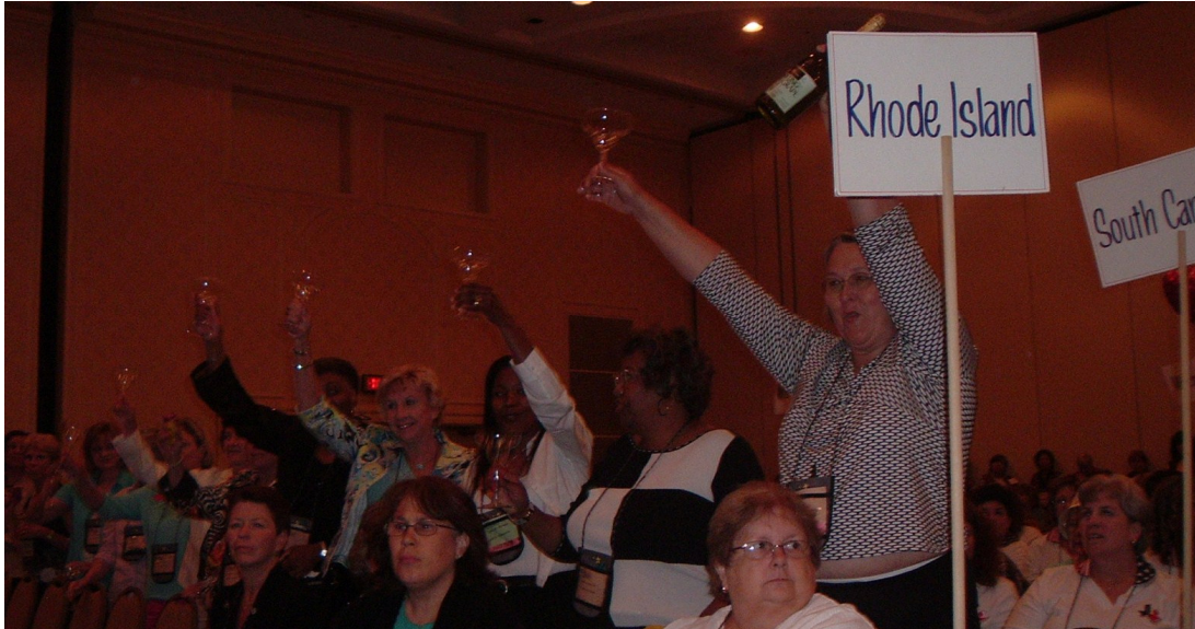
South Carolina Delegates Celebrate a Funded Mandate for School Nurses