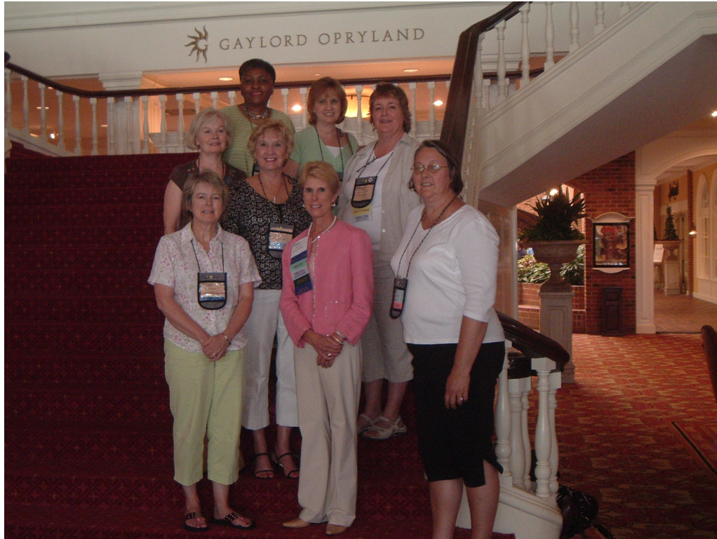
South Carolina delegates gathered at the Magnolia staircase at the Gaylord Opryland Resort.